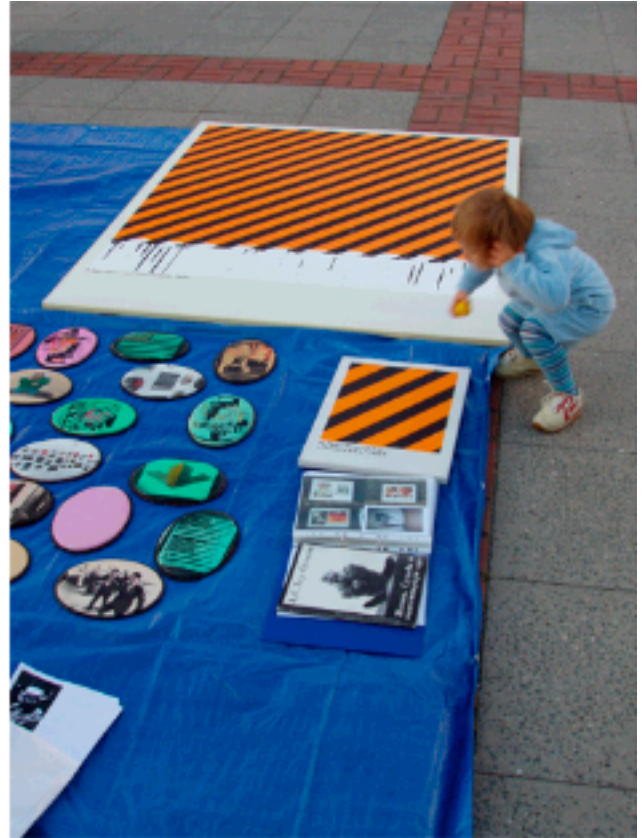
Avdei Ter-Oganians works attracted big girls as well as small girls!