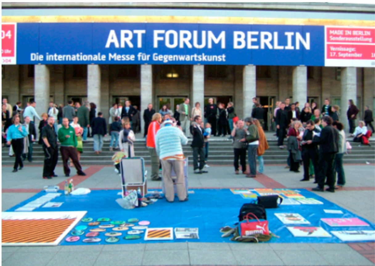
The russian <<FORWARD!>> GALLERY from Moscow was represented for the first time at the ART FORUM Berlin 2004 Contemporary Art Fair with a well situated (free) booth of 20 sq. meters!