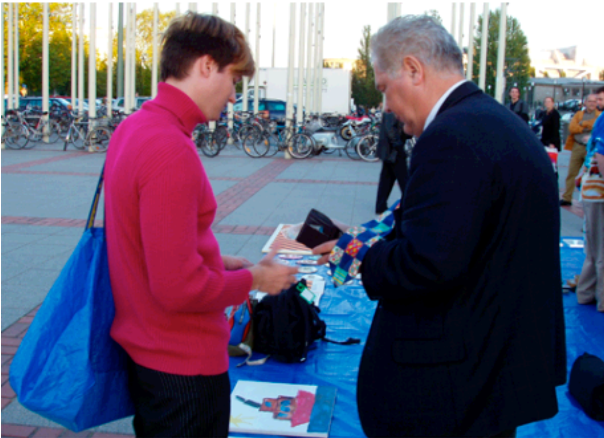
... who bought Brodys „Snowman“ childrens painting for 500 euros cash!