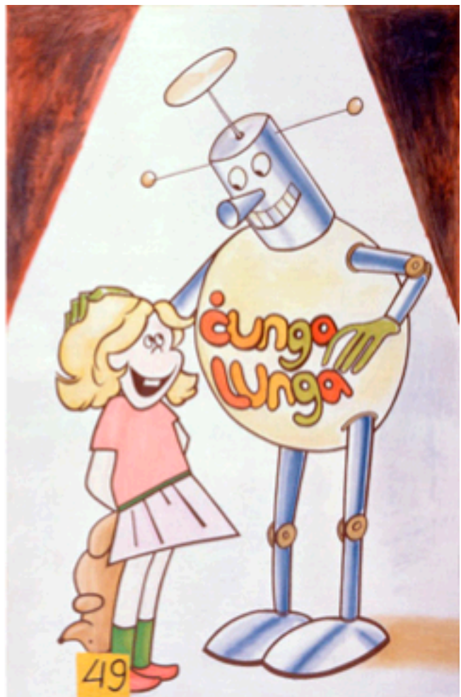
Misha & Grisha, 2001, comic - Chunga Lunga, 2001, oil on canvas