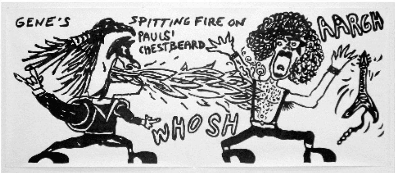
GENE SPITTING FIRE (KISS FAN-ART RE-DRAWING) 2004 black edding marker on paper 133 x 320 cm