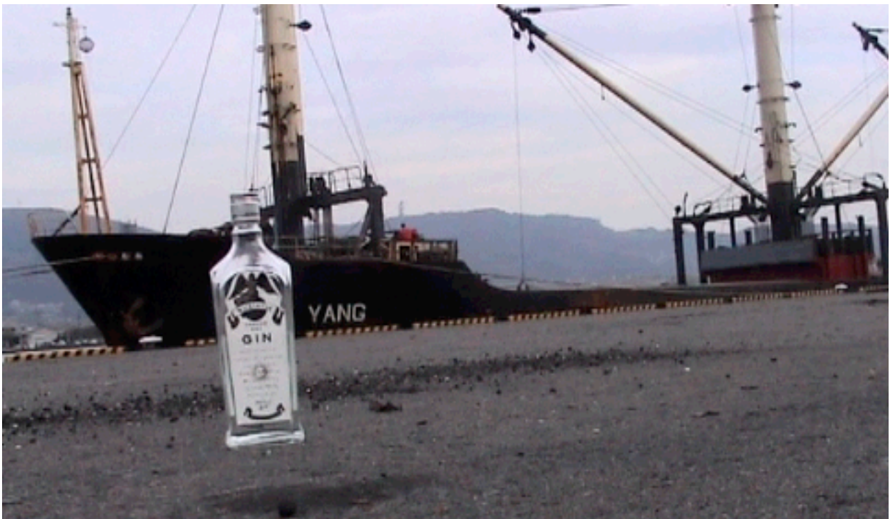
Gin&Yang , video, 2002

Extracts from „Little Wonders“, text by Vladan Sir in Umelec International, vol. 6, 2002