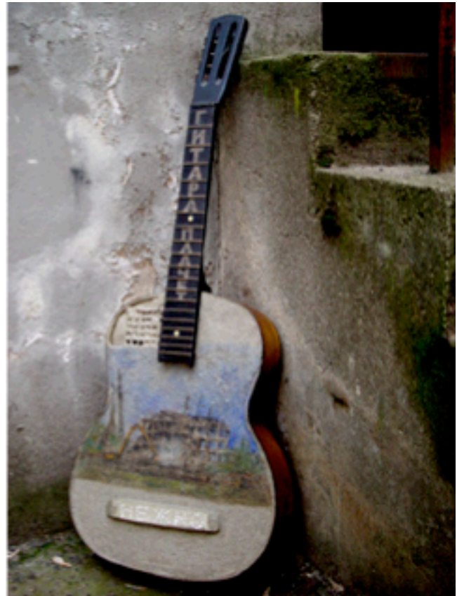
"Marry me", wood, 64 x 45 cm, 1997 and „Guitar“, wood, concrete, paint, 2003.